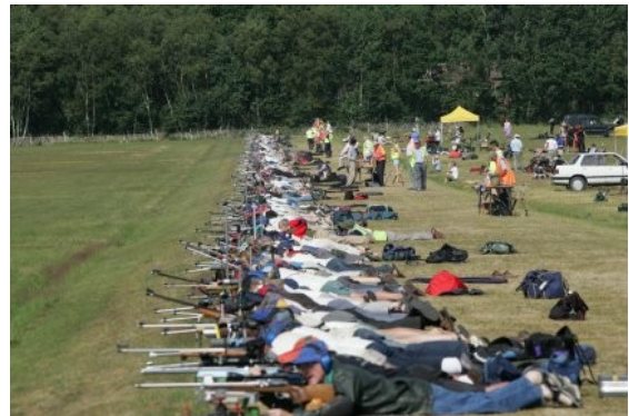
300 shottists per detail, waiting for the chief Range officer's command to commence firing