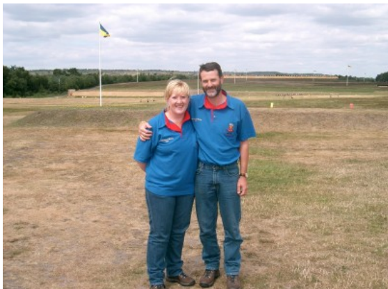
Stickledown Range in the background - 56 targets for shooting 900 and 1000 yards