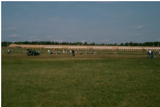
Century Range, Bisley - 108 targets, for shooting 300, 500 and 600 yards