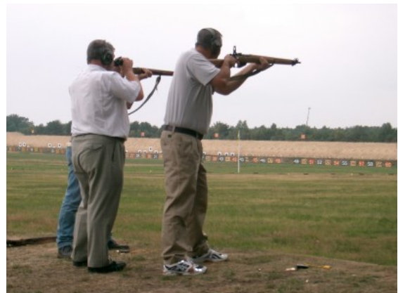
Shooting off-hand at 300 yards with .303's with battle sights at Bisley, England