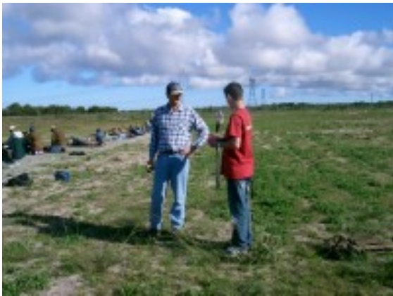
Two of the Range Officers at the Club Shoot